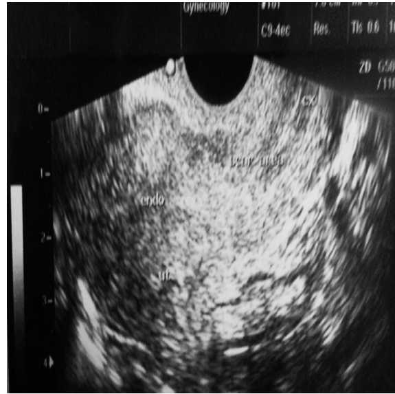
Figure 3: Transvaginal scan 16 weeks after the treatment showing a minimal hypoechoic area at the scar area. The patient was initially using barrier method of contraception but later underwent laparoscopic tubal ligation.

uterus with a minimal hypoechoic area in the scar area [Figure 3].